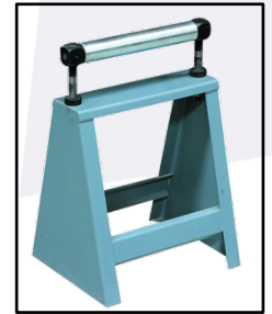
Roller Stand & Table