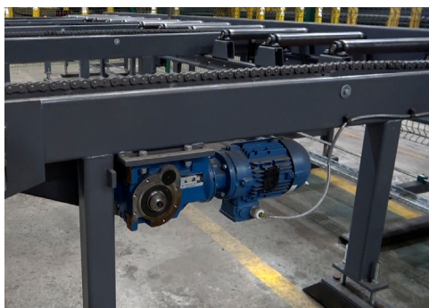
Cross transfer drive unit