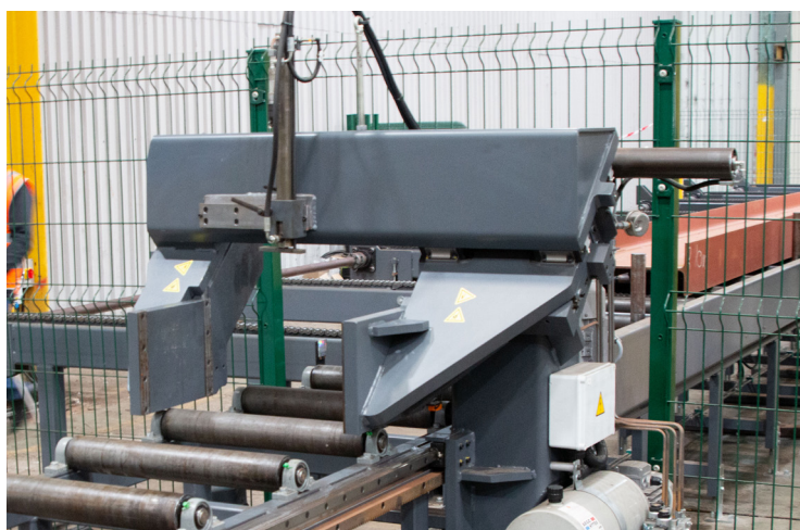
Long stroke feeder