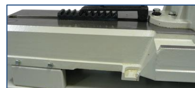
Quick Action Vice