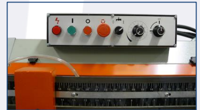
Clear, Simple Controls