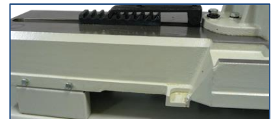
Quick Action Vice