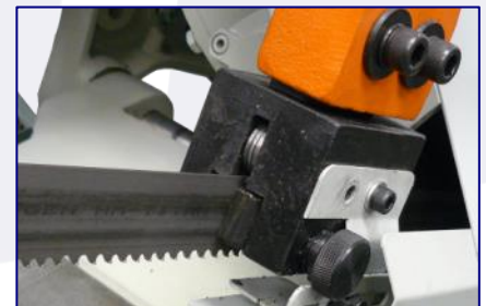
34mm Blade with Carbide Guides