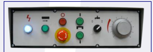
Clear, Simple Controls