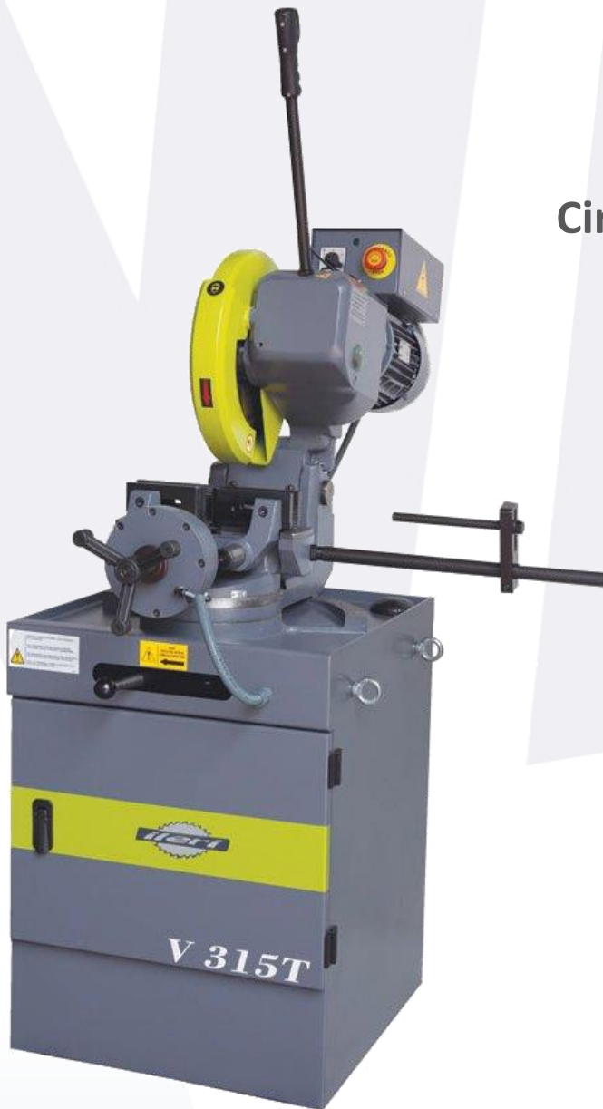
Heavy-duty Motor & Gearbox