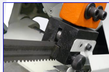
34mm Blade with Carbide Guides