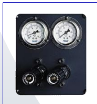
Vice Pressure Reduction