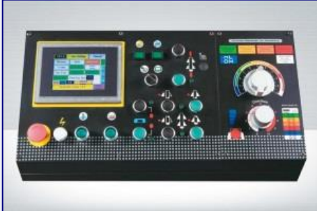
Colour touch screen controls