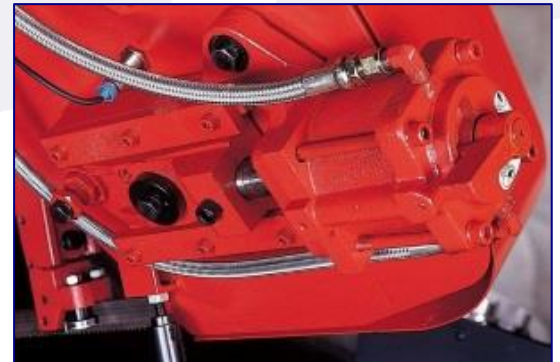
Hydraulic Blade Tension