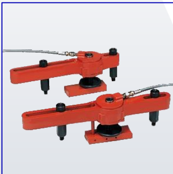
Hydraulic Top Clamps