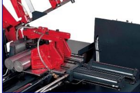
Full stroke hydraulic vices