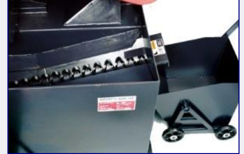
Swarf conveyor (cart not included)