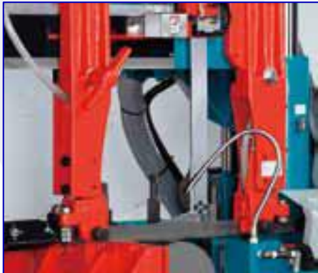
Fast Approach 'T Bar'