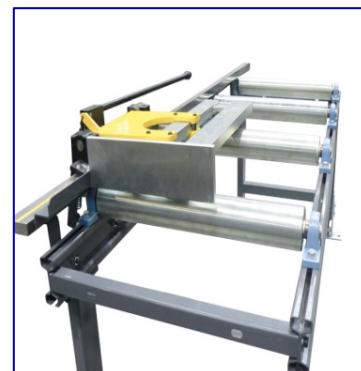
Conveyors & Measuring