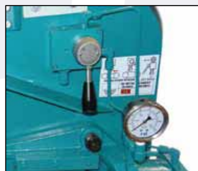
Hydraulic blade tension