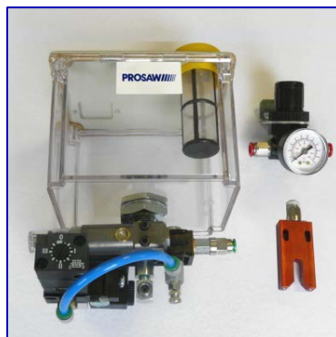
Mist Spray Lubrication